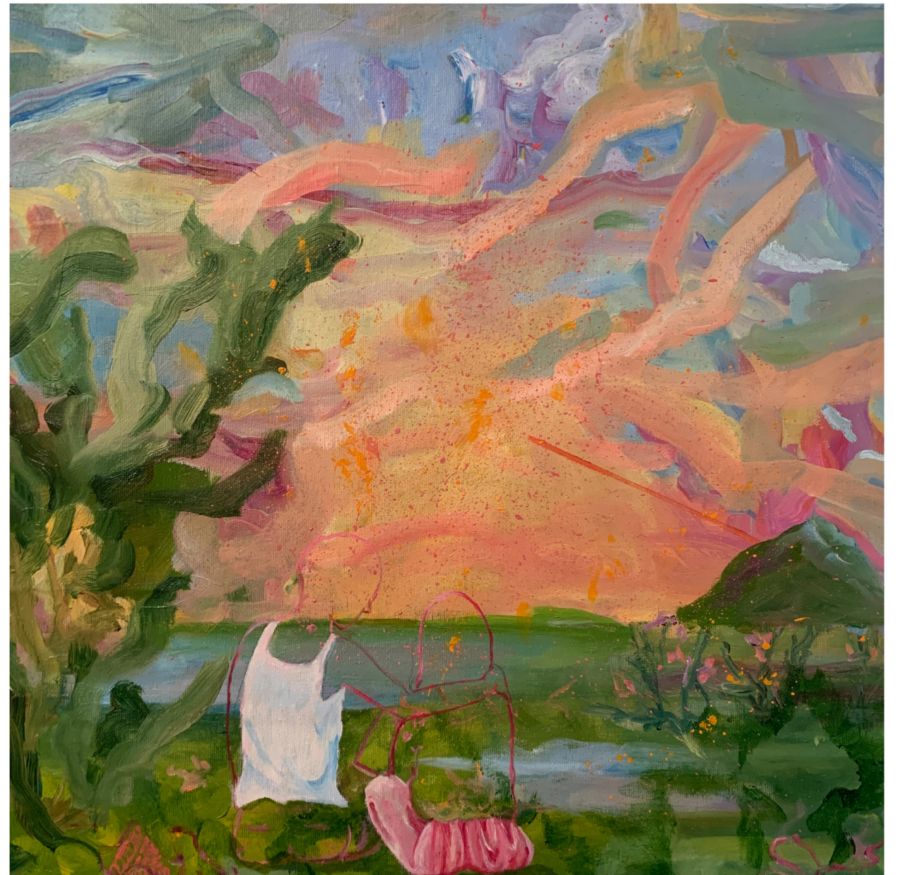
DREAMING Oil on canvas 50x50 cm 2023