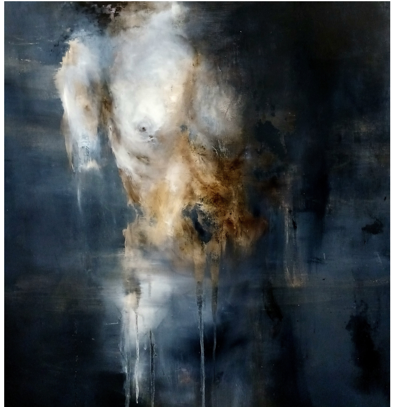
ΘΥΜΟΣ (THUMOS) Mixed media oil and acrylic on mdf panel, single piece 85x87 cm 2023