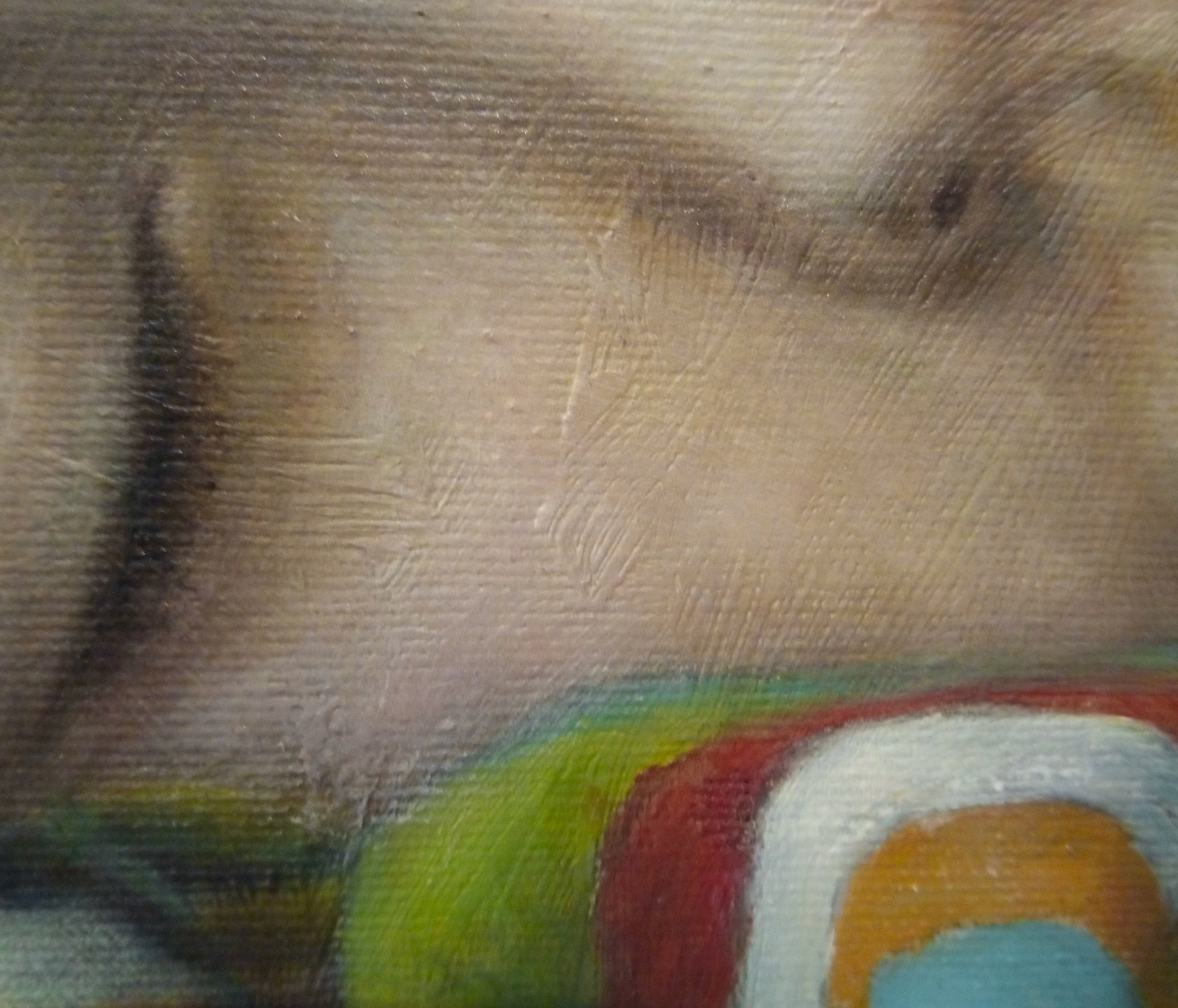
Stefano Anselmi Italy