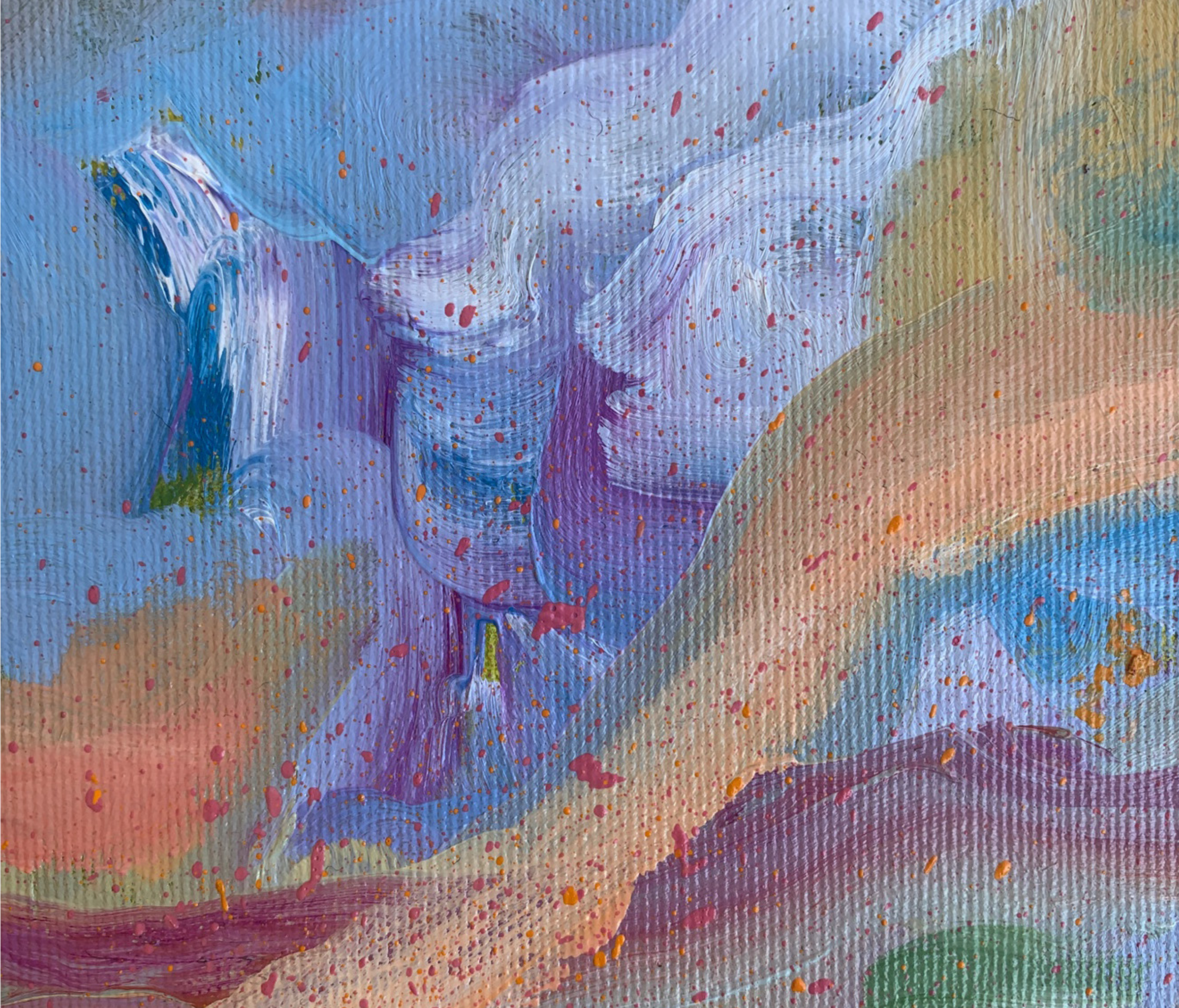
Beatrice Bobst Switzerland