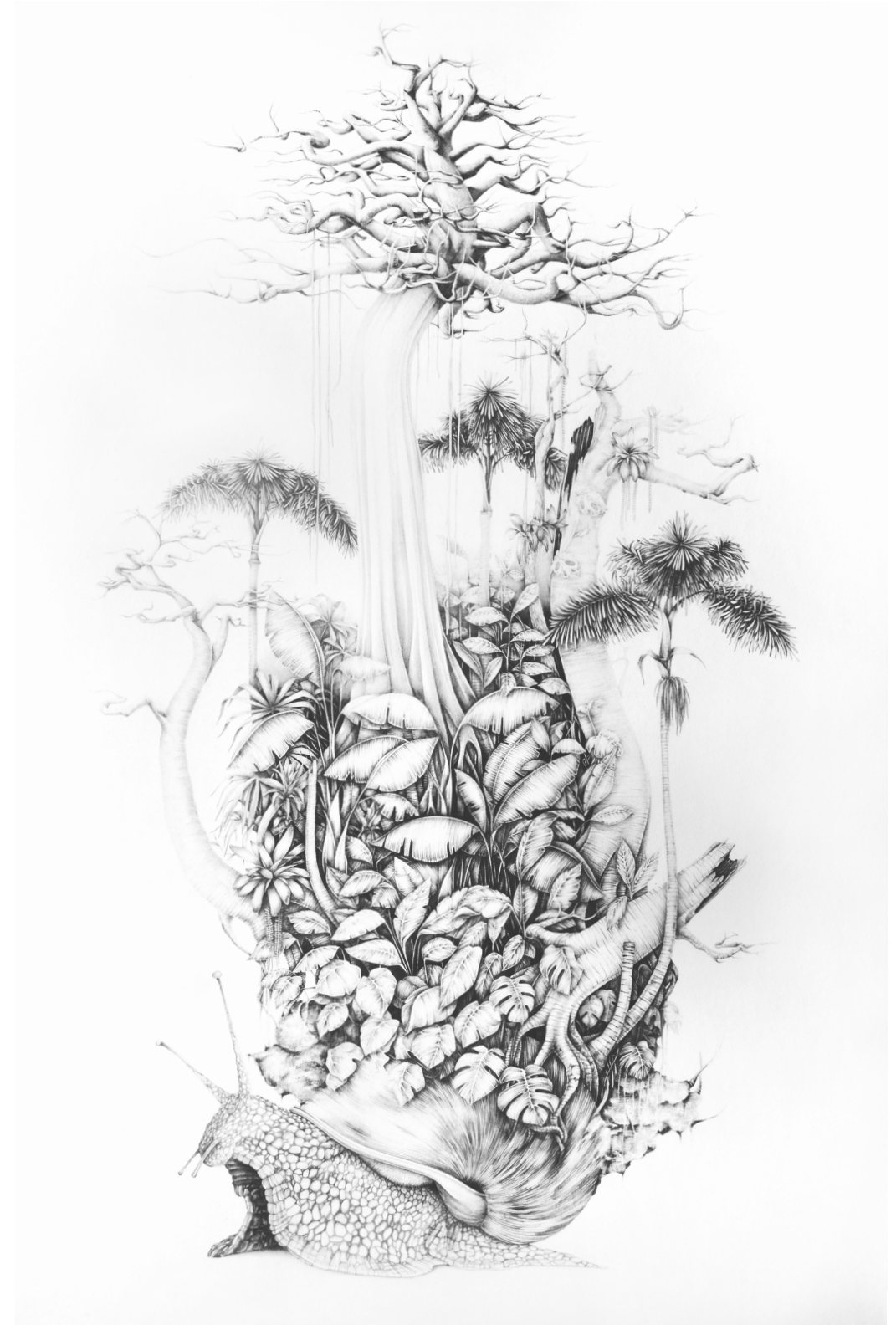
EXODUS Graphite on paper 100x150 cm 2023