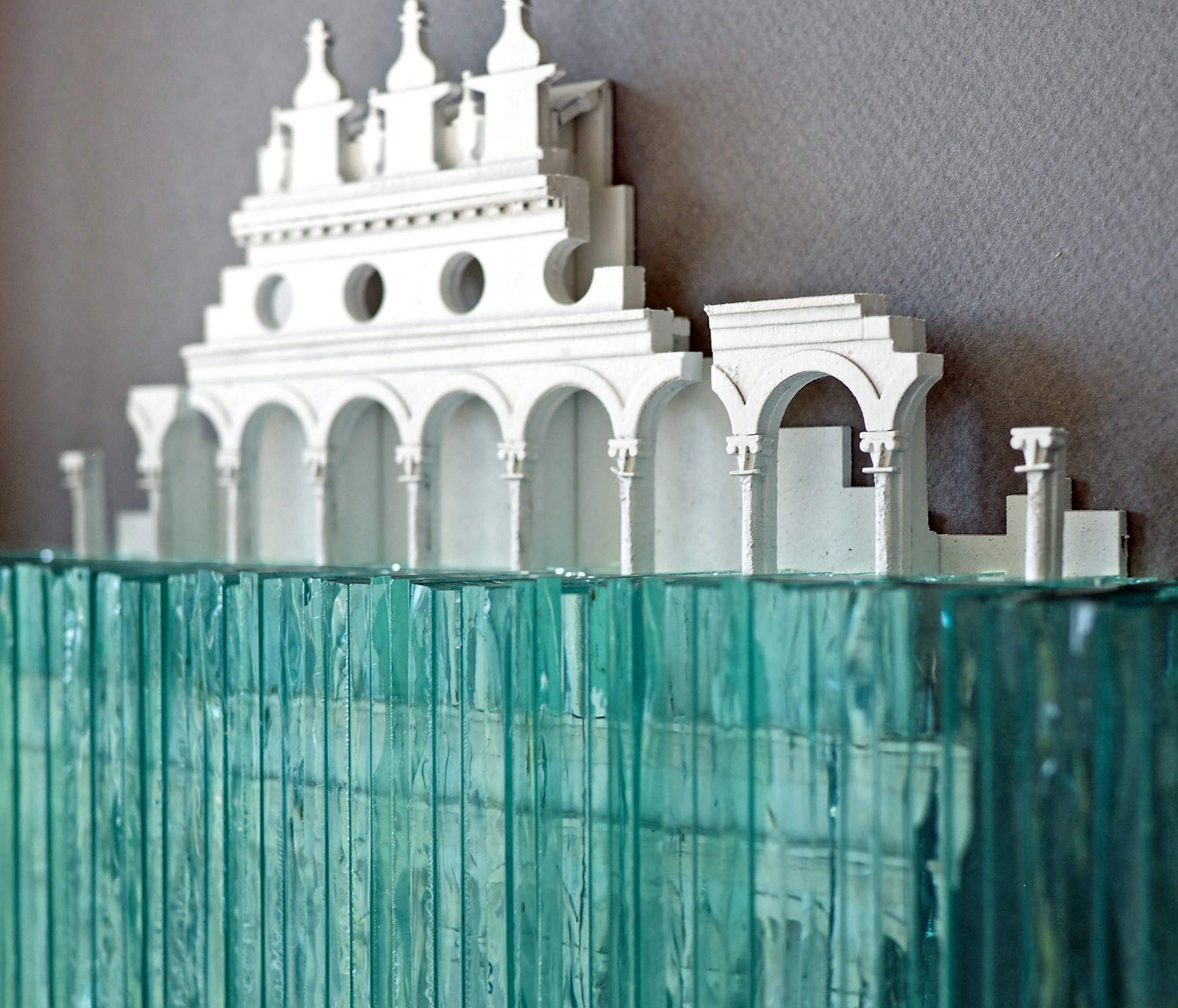
Damjan Popelar Slovenia