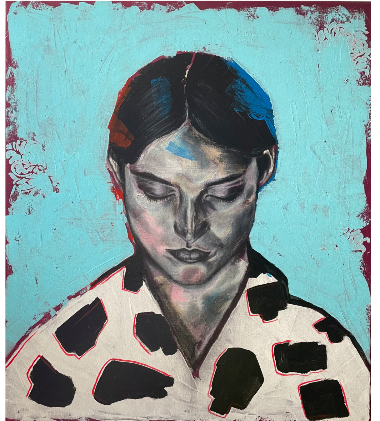
LILY Mix-media (acrylic painting and charcoal drawing) on canvas 80x70cm 2024