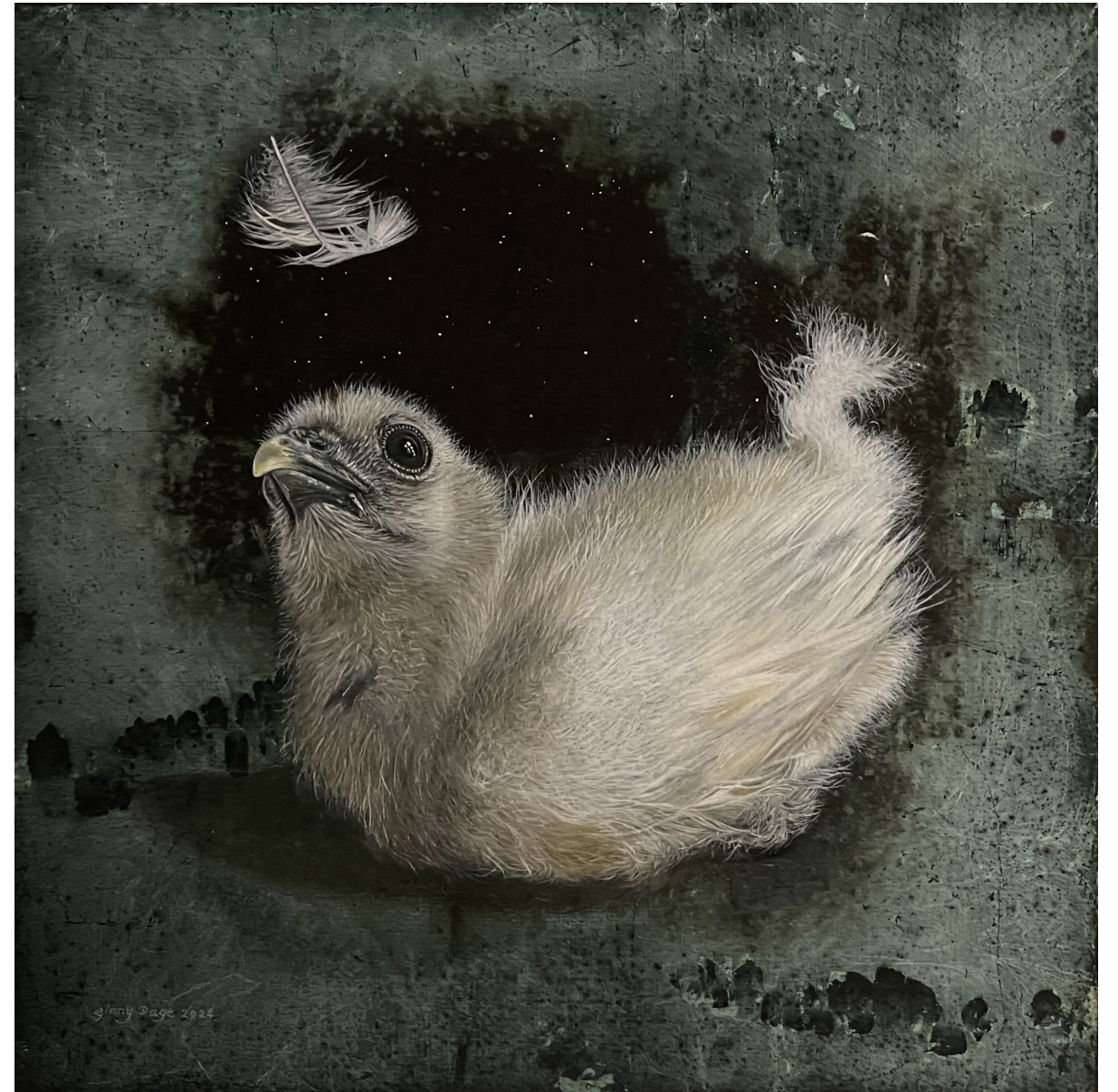
HOPE Oil on patinated copper leaf on panel 20x20 cm 2024