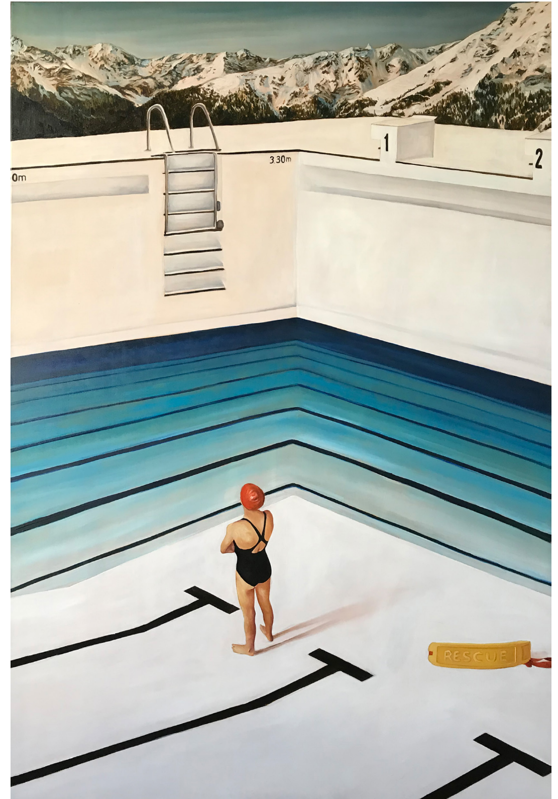
ASPIRAZIONI Oil on canvas 100x150 cm 2020