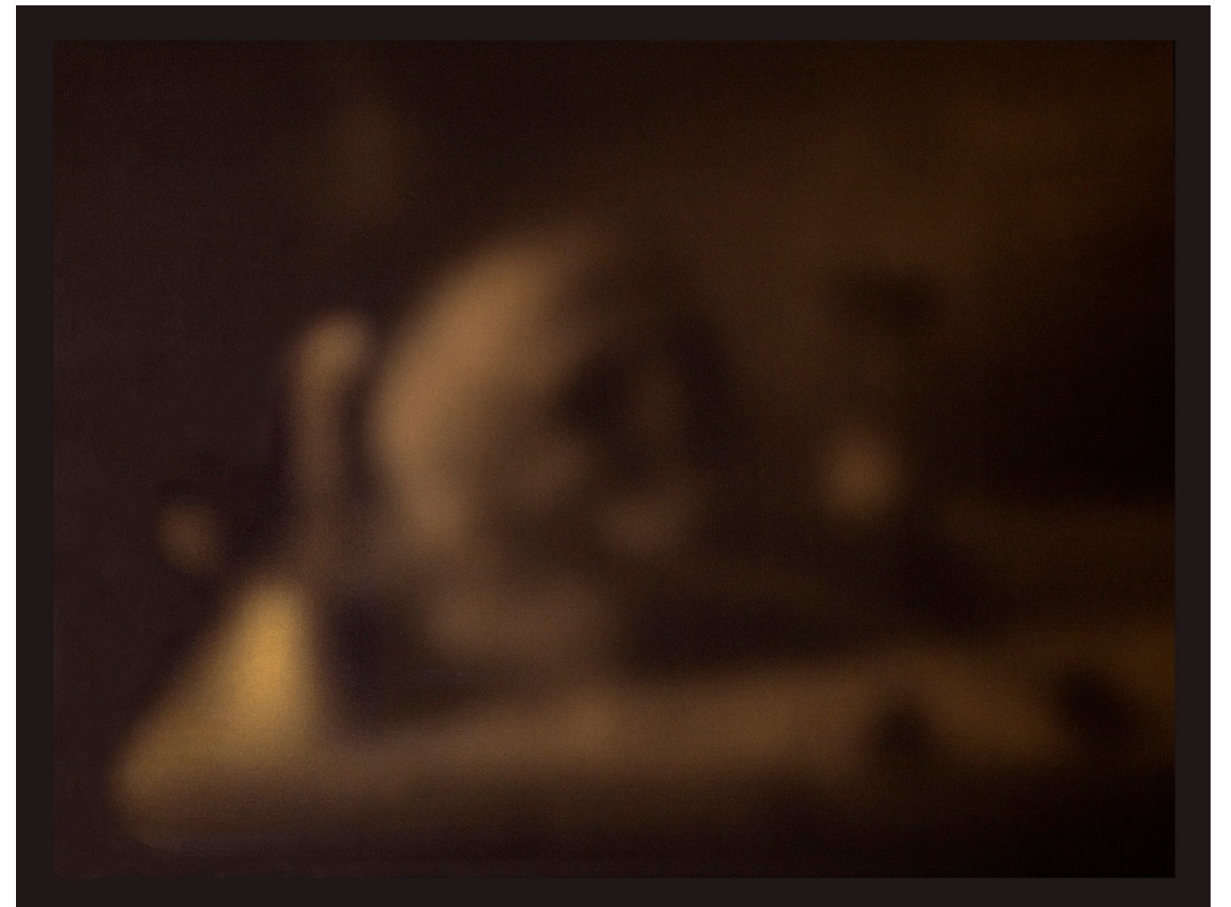
APORIA - MEMENTO Ceramic ink fusion print on glass - bee pollen powder 64x84x5 cm 2020