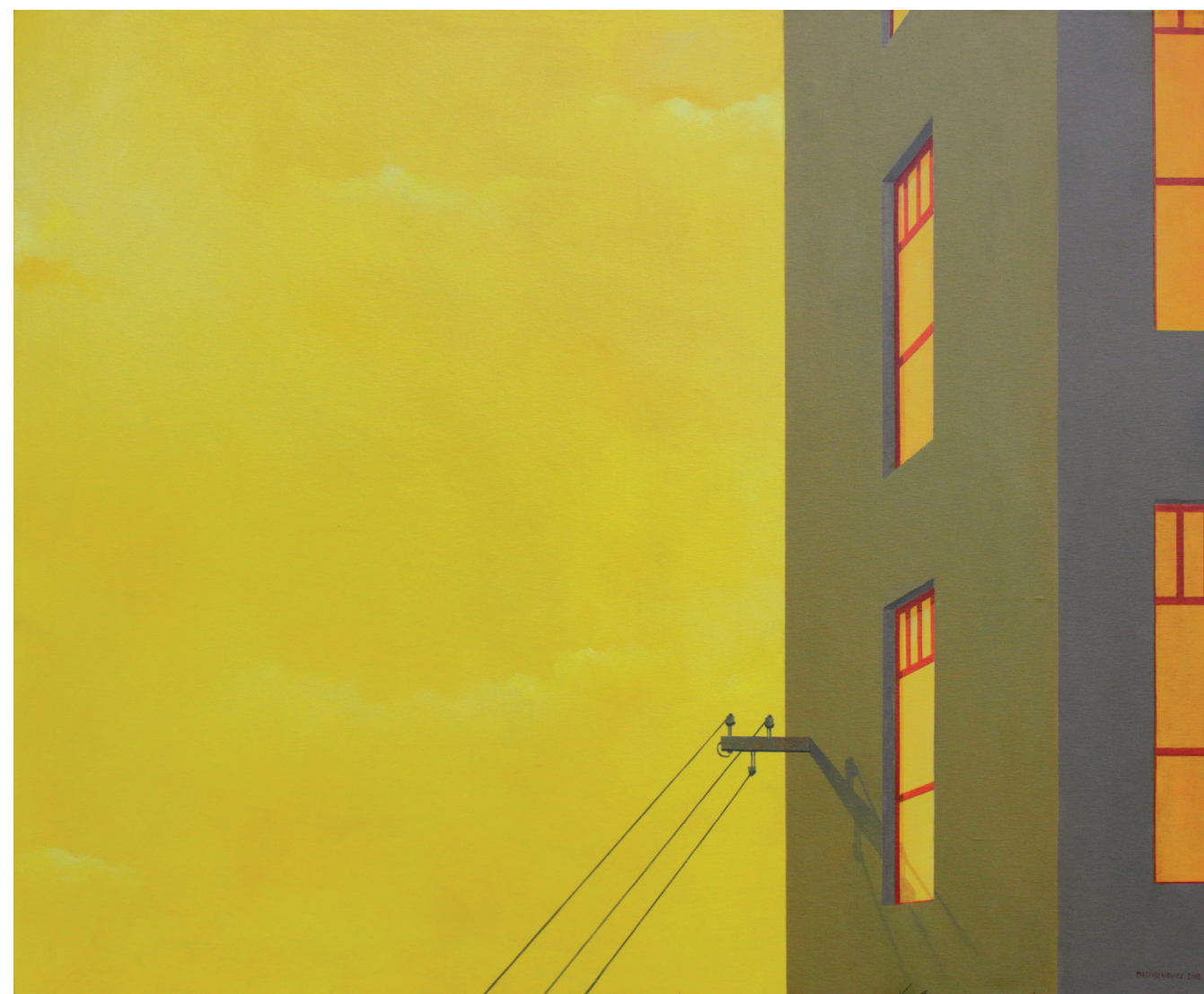
WORLD WITHOUT US (1)