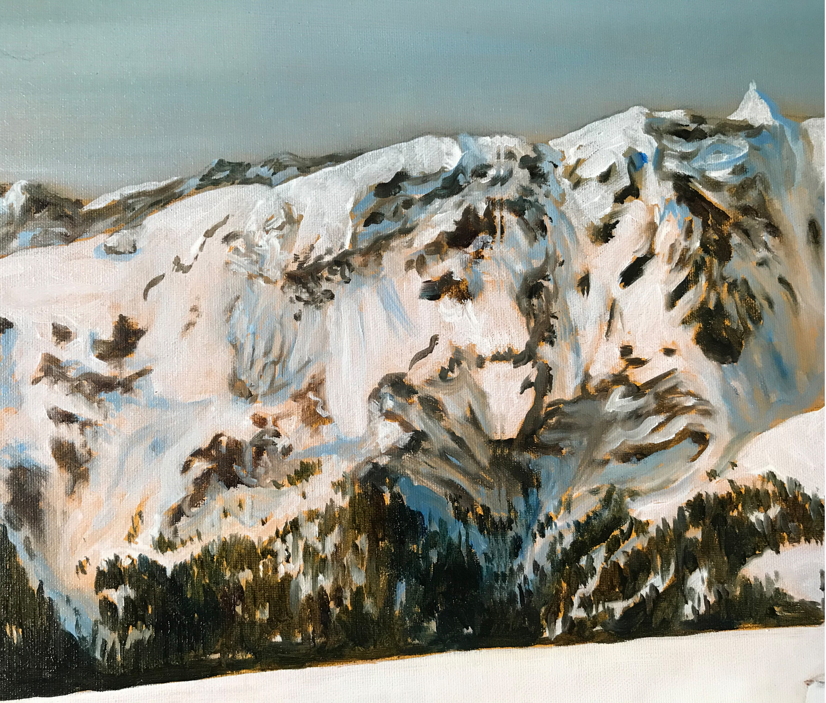
Sofia Fresia Italy