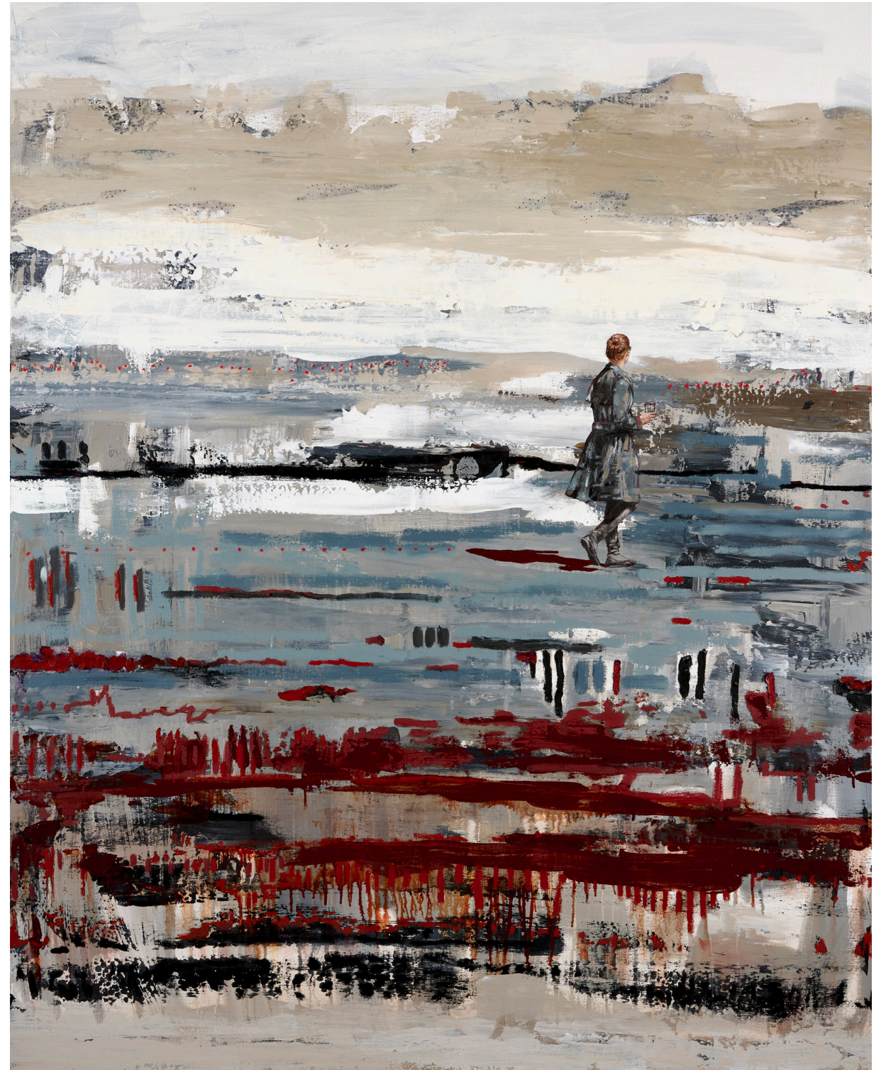
OVER FEAR AND INTO FREEDOM

Oil, acrylic, pastel on linen 155x125x3 cm 2020