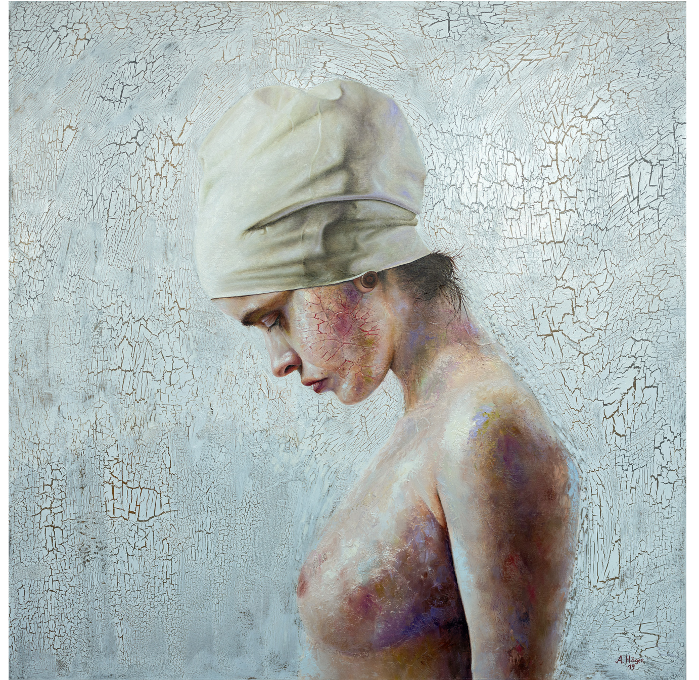
THE SWIMMER Oil on canvas 80x80 cm 2019