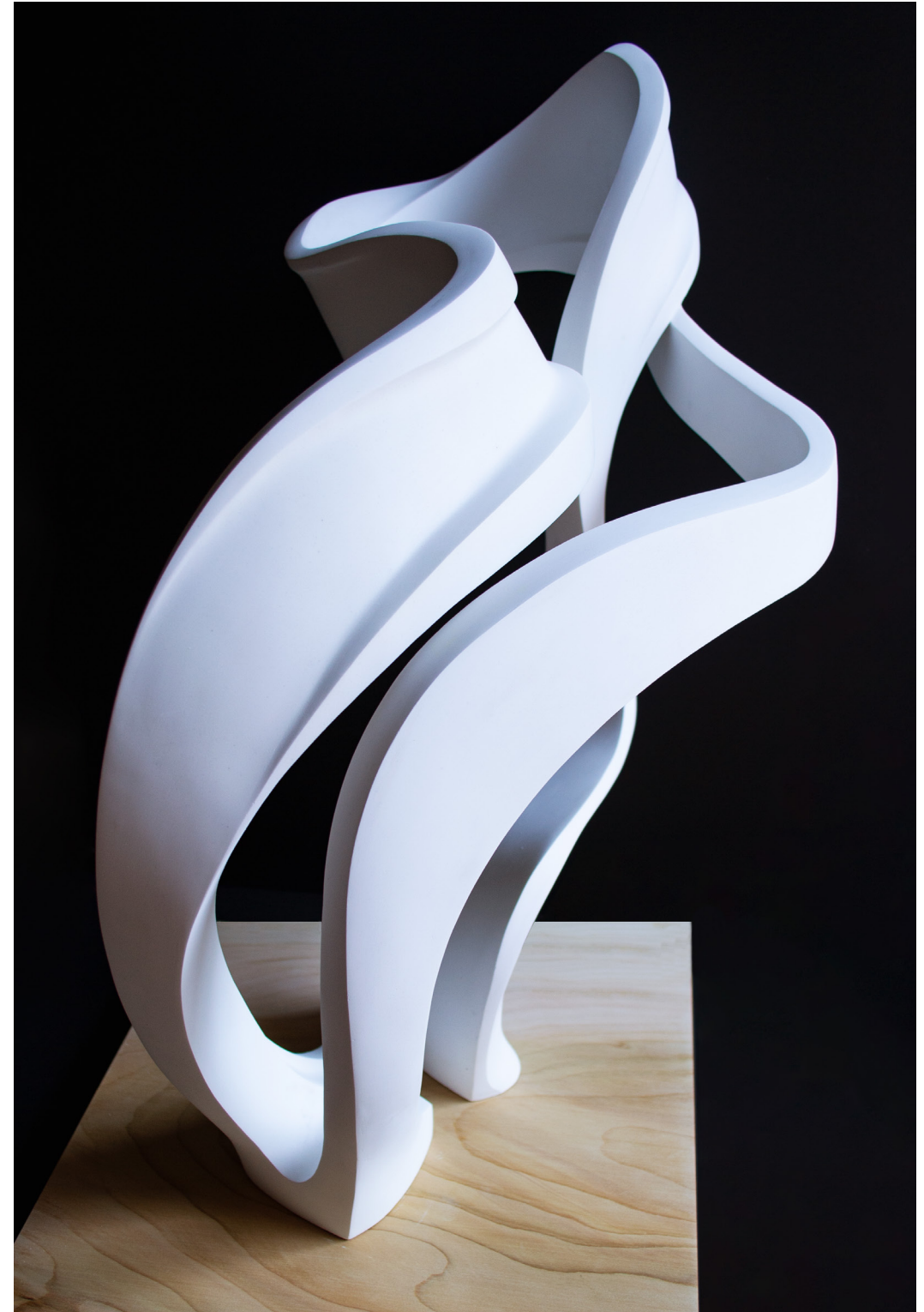
TEMPO ORGANICO Natural resin cast 50x40x28 cm 2020