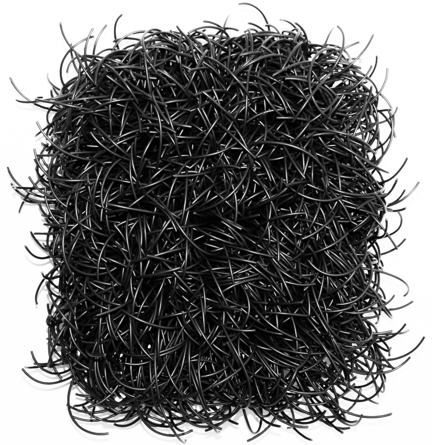
ARMONIE IN NERO Rubber mounted on an iron structure 34x40x12 cm 2020