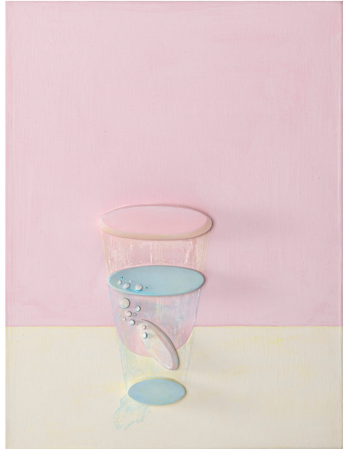
ASPIRINA C acrylic, synthetic past, extruded polyester on canvas 30x40 cm 2020