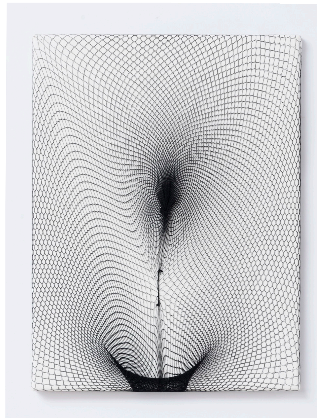
ME IS SOMEONE ELSE Nylon Tights on Canvas 30x40 cm 2017